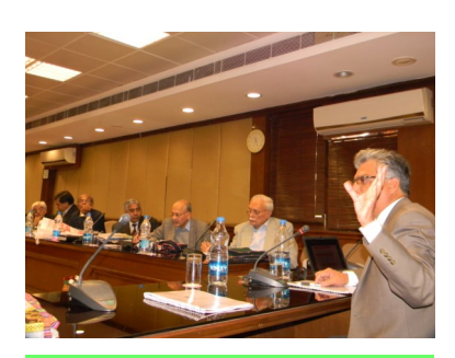
Vice Chancellor addressing the University Court

Learning from experience is a faculty almost never practiced.